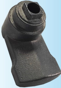
3D Rendered View